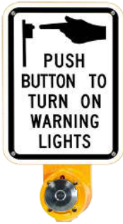
ADA Compliant PushButton and Frame with sign