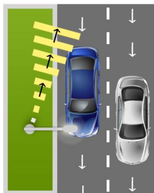
Armadillo on the side with 2 lanes incoming. No outgoing lanes can be detected